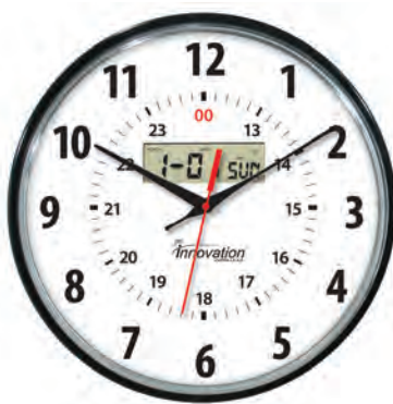
16" (40.64cm) Part # 220001L - Battery