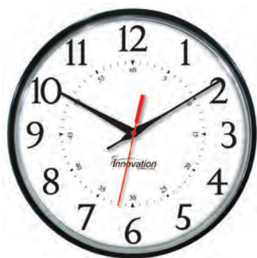
13" (33.02cm) Part # 210001 - Battery Part # 312001 - Electric (120 VAC) Part # 311001 - Electric (24 VAC)