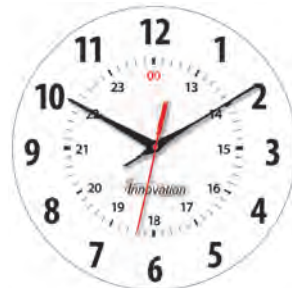
Standard Military 12/24 Part # SM24

Additional Custom Logo Designs Available