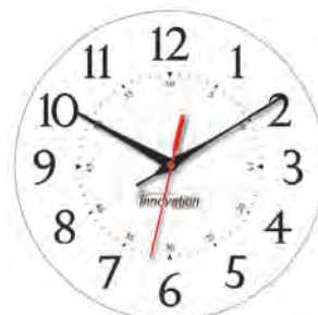
Standard Arabic 12/60 Part # SA60