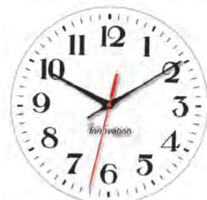
Classic Arabic Part # CA00