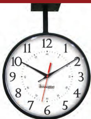
13" (33.02cm) Double Sided Ceiling Mount Part # 210011 - Battery