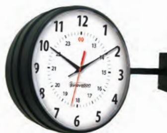
13" (33.02cm) Double Sided Wall Mount Part # 210021 - Battery