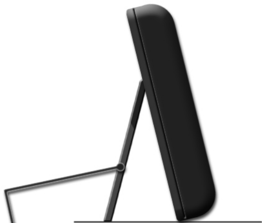
Folding Table Stand